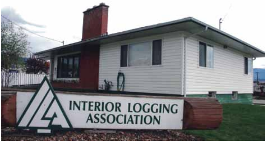
ILA office in Vernon, BC.

forest awareness. By 2002, the original van was replaced as the demands for attendance with the van at community and school events grew.